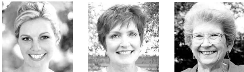
Figure 2: The three different Anglo females varying by age paired with the auditory stimuli

To manipulate perceived speaker age we adopted Hay et al.'s (2006) matched guise design, but with an expanded age spectrum. The auditory stimuli were presented in the guise of three Anglo females of different ages by displaying to the participants one of three photographs (Figure 2).